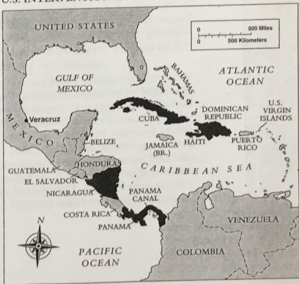
U.S. INTERVENTION IN THE CARIBBEAN, 1898 TO 1917

Conciliation Treaties Wilson's commitment to the ideals of democracy and peace was fully shared by his famous secretary of state, William Jennings Bryan. Bryan's pet project was to negotiate treaties in which nations pledged to (1) submit disputes to international commissions and (2) observe a one-year cooling-off period before taking military action. Bryan arranged, with Wilson's approval, 30 such conciliation treaties.