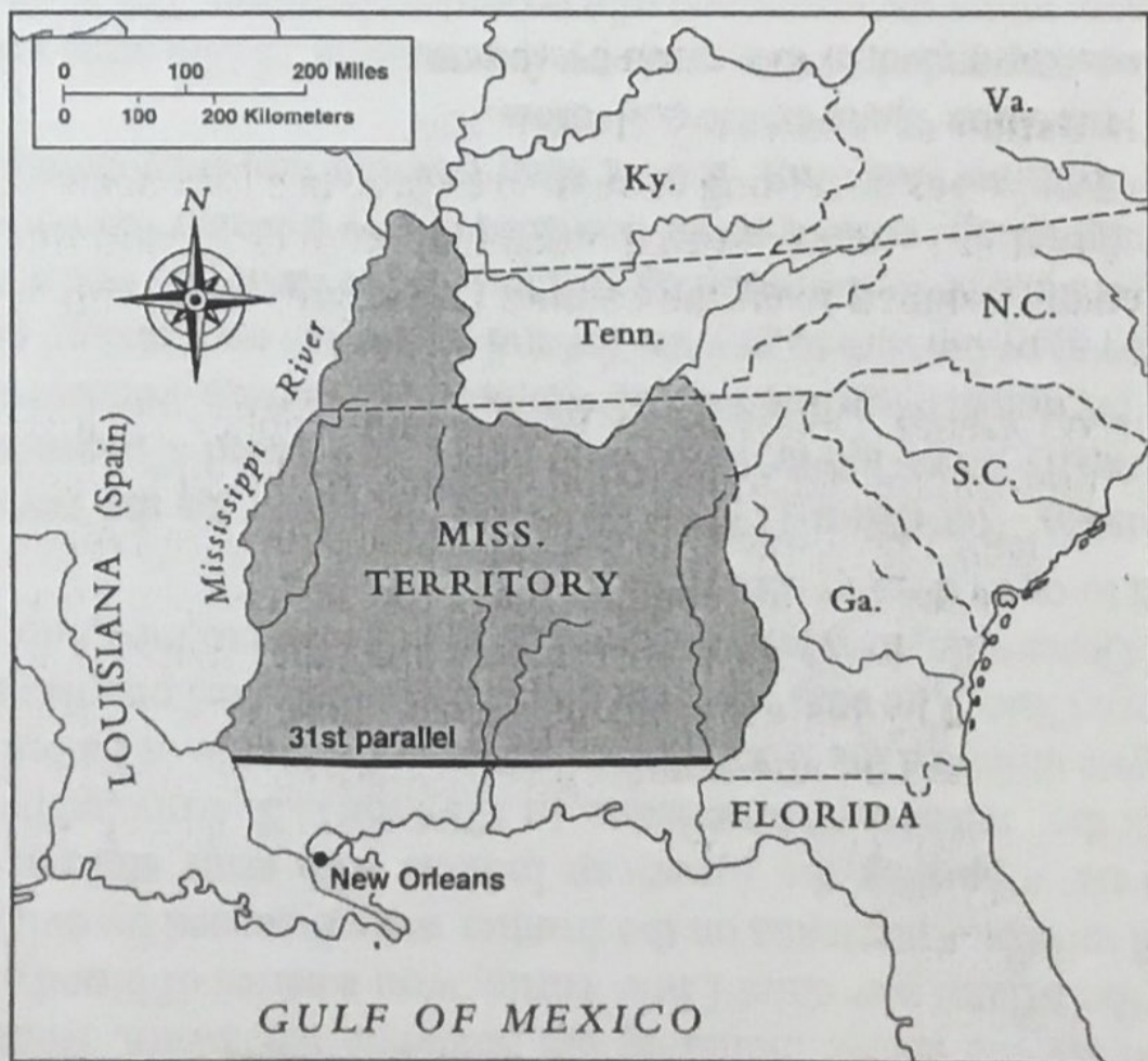
PINCKNEY'S TREATY, 1795

In addition to coping with foreign challenges, stabilizing the nation's credit, and organizing the new government, Washington faced a number of domestic problems and crises.