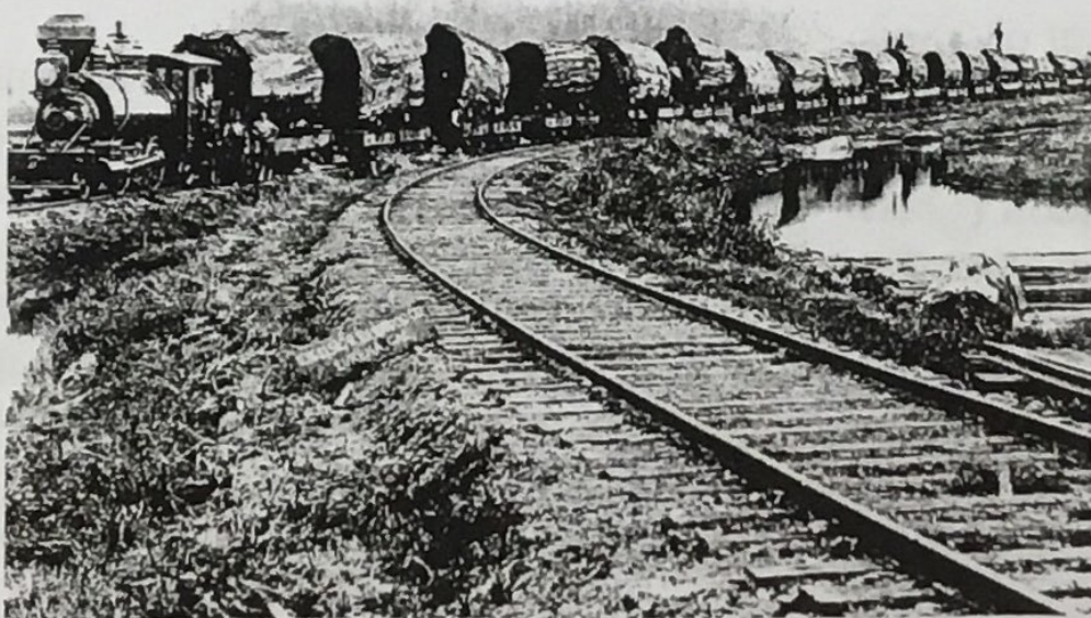
Source: Logging in California, 1909.

The concerns over deforestation sparked the conservation movement, and the breathtaking paintings and photographs of western landscapes helped to push Congress to preserve such western icons as Yosemite Valley as a California state park in 1864 (a national park in 1890), and to dedicate the Yellowstone area as the first